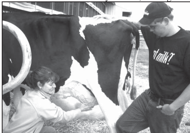
Photo: Many visitors enjoyed the experience of being able to milk a cow, provided by the NICC Dairy Science Club.

Be sure to keep your eyes open for next years Breakfast on the Farm date, coming June 2012!